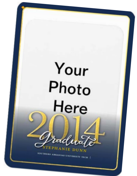
Personalized Graduation Card option. Comes in 5x7 only.